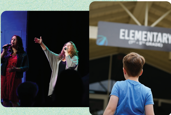
Northeast Weekly Averages

Sunday worship statistics since February '22.